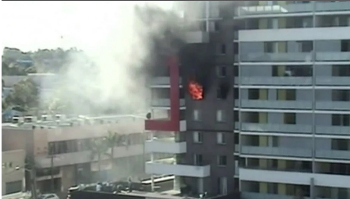
The fatal blaze in a Bankstown apartment block in September 2012. ABC NEWS 24