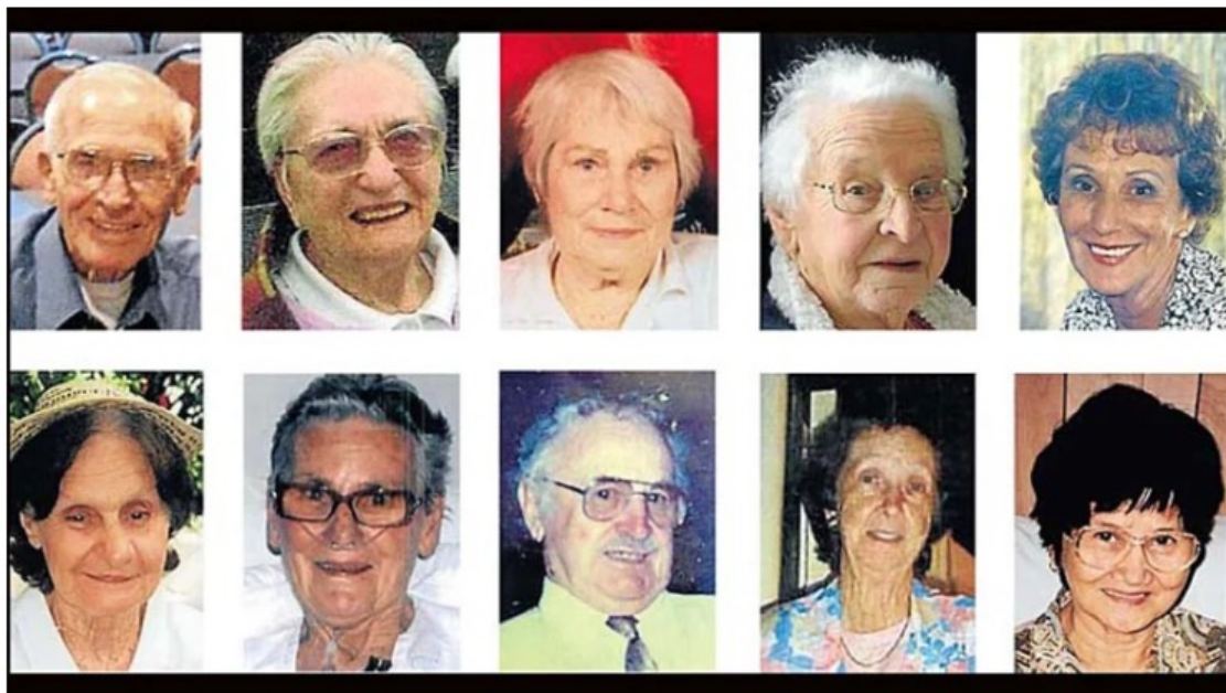
Victims: These residents died as a result of the fire and a further eight suffered from serious injuries. Firefighters said they could hear residents calling out for help.